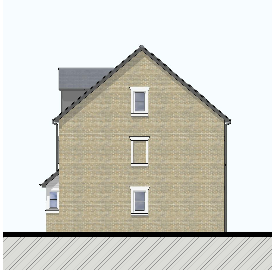
SIDE ELEVATION 2 (RIGHT SIDE, PLOT 3)