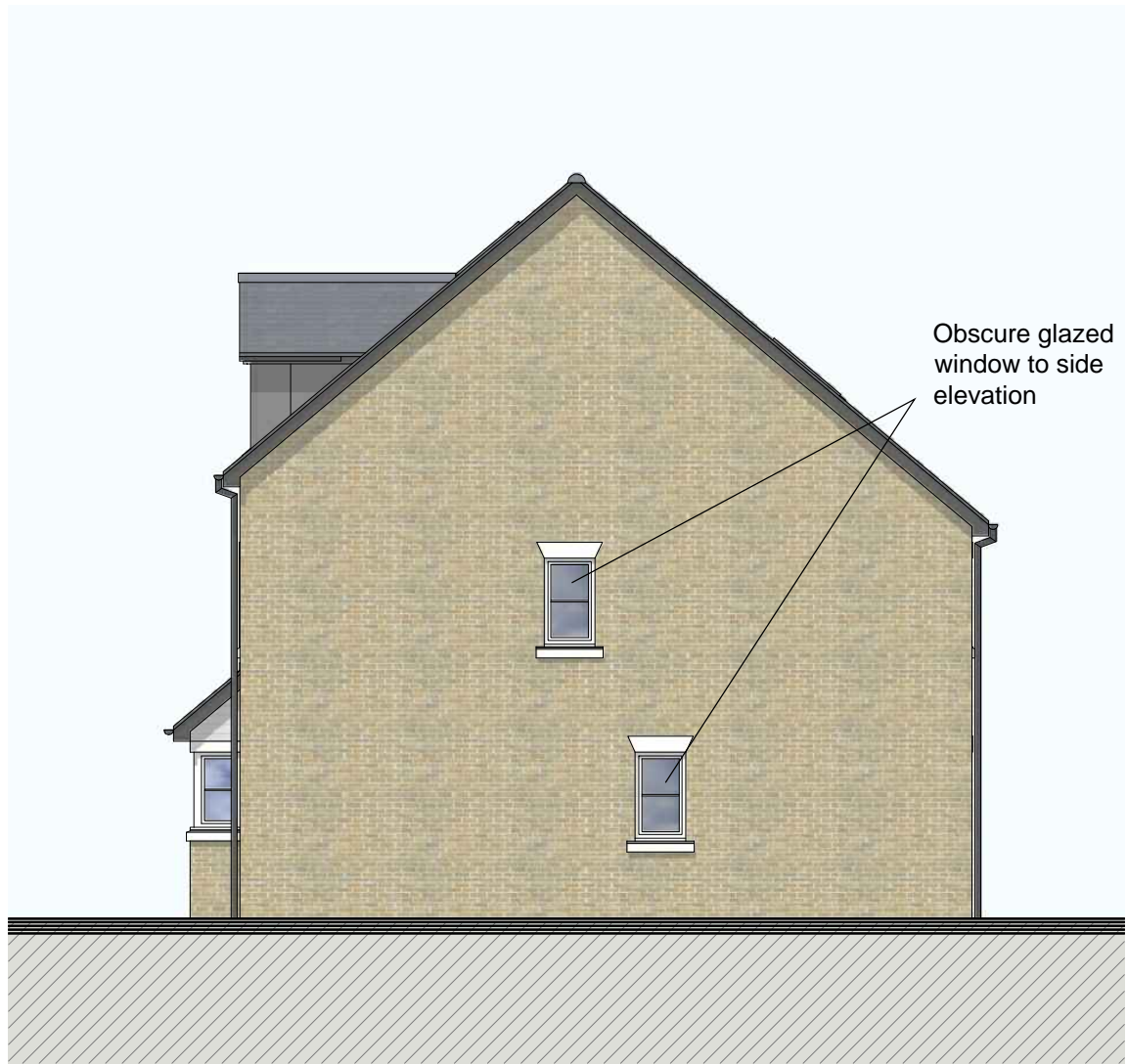
SIDE ELEVATION 2 (RIGHT SIDE, PLOT 5 & 7)