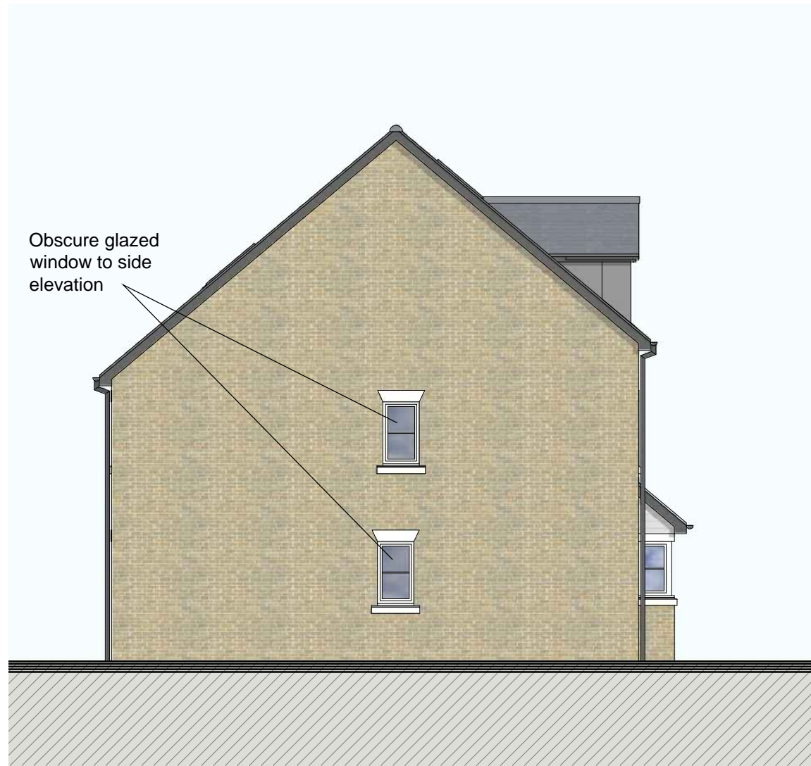
SIDE ELEVATION 1 (LEFT SIDE, PLOT 4 & 6)