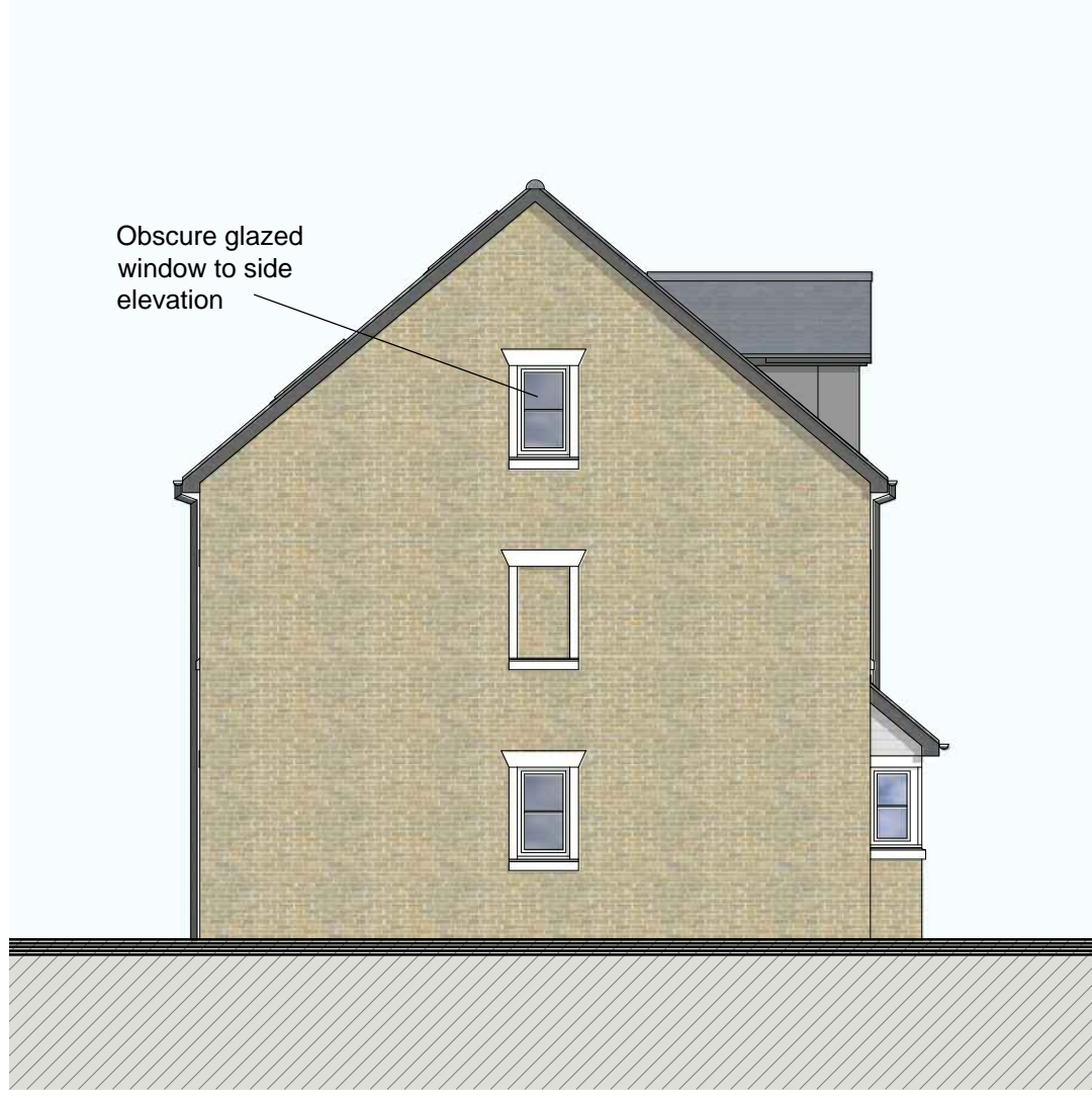
SIDE ELEVATION 1 (LEFT SIDE, PLOT 1)