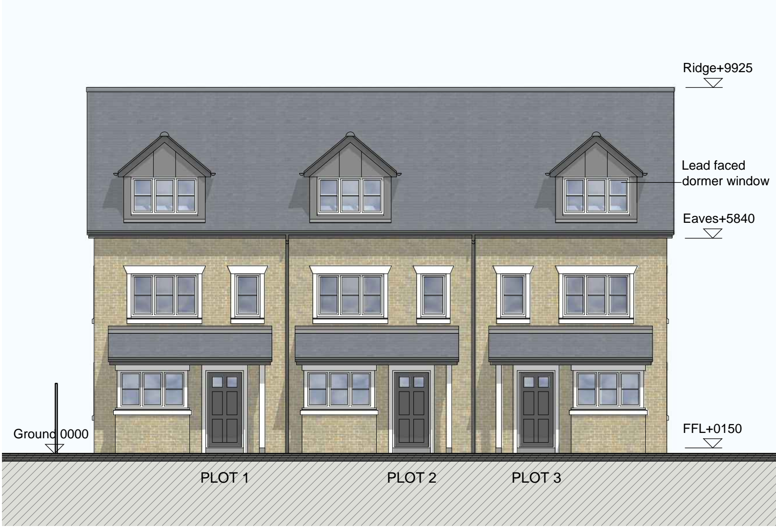
FRONT ELEVATION (FACING STRATFORD ROAD)