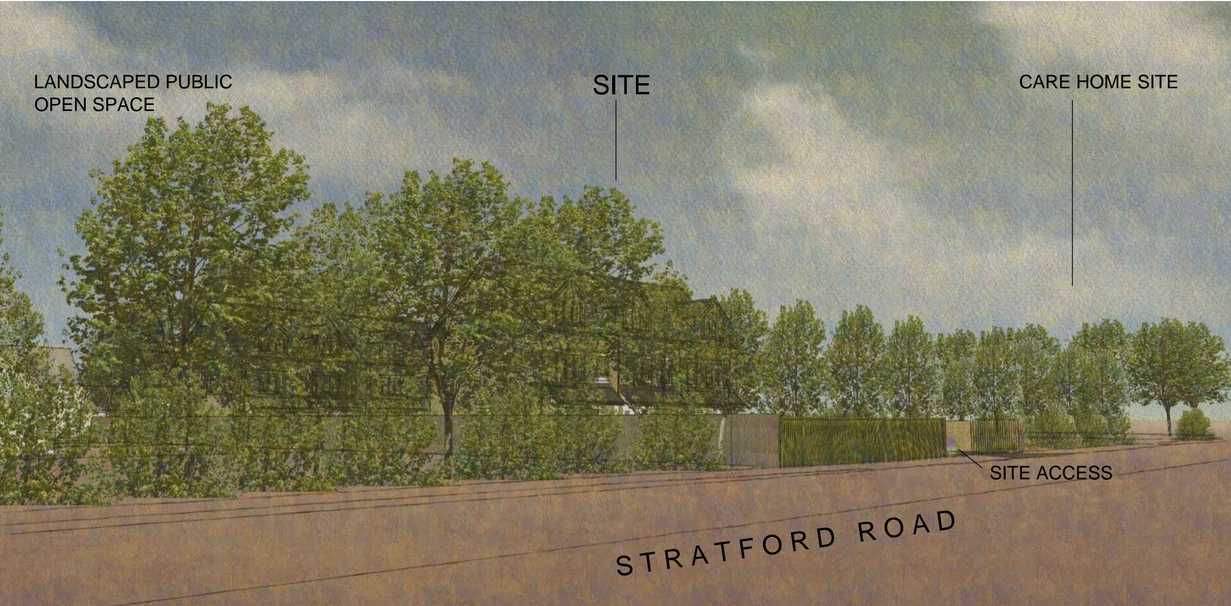
VIEW 4 - FROM STRATFORD ROAD LOOKING SOUTH