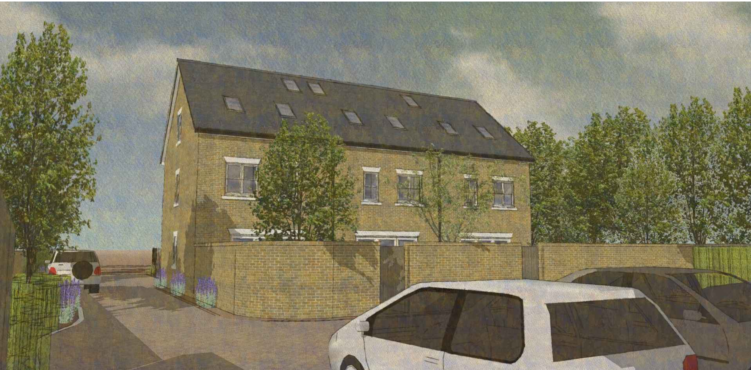
VIEW 8 - FROM COURTYARD, REAR OF PLOTS 1-3

SKETCH VIEWS (NTS) NOTE: REFER TO DRAWING 05 FOR SKETCH VIEWS 1 & 2