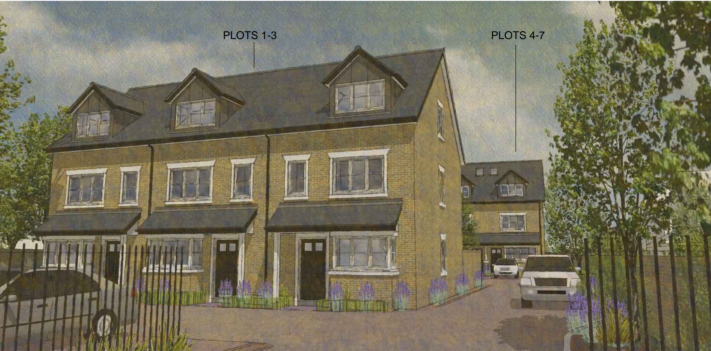
VIEW 6 - FROM ENTRANCE TO DEVELOPMENT