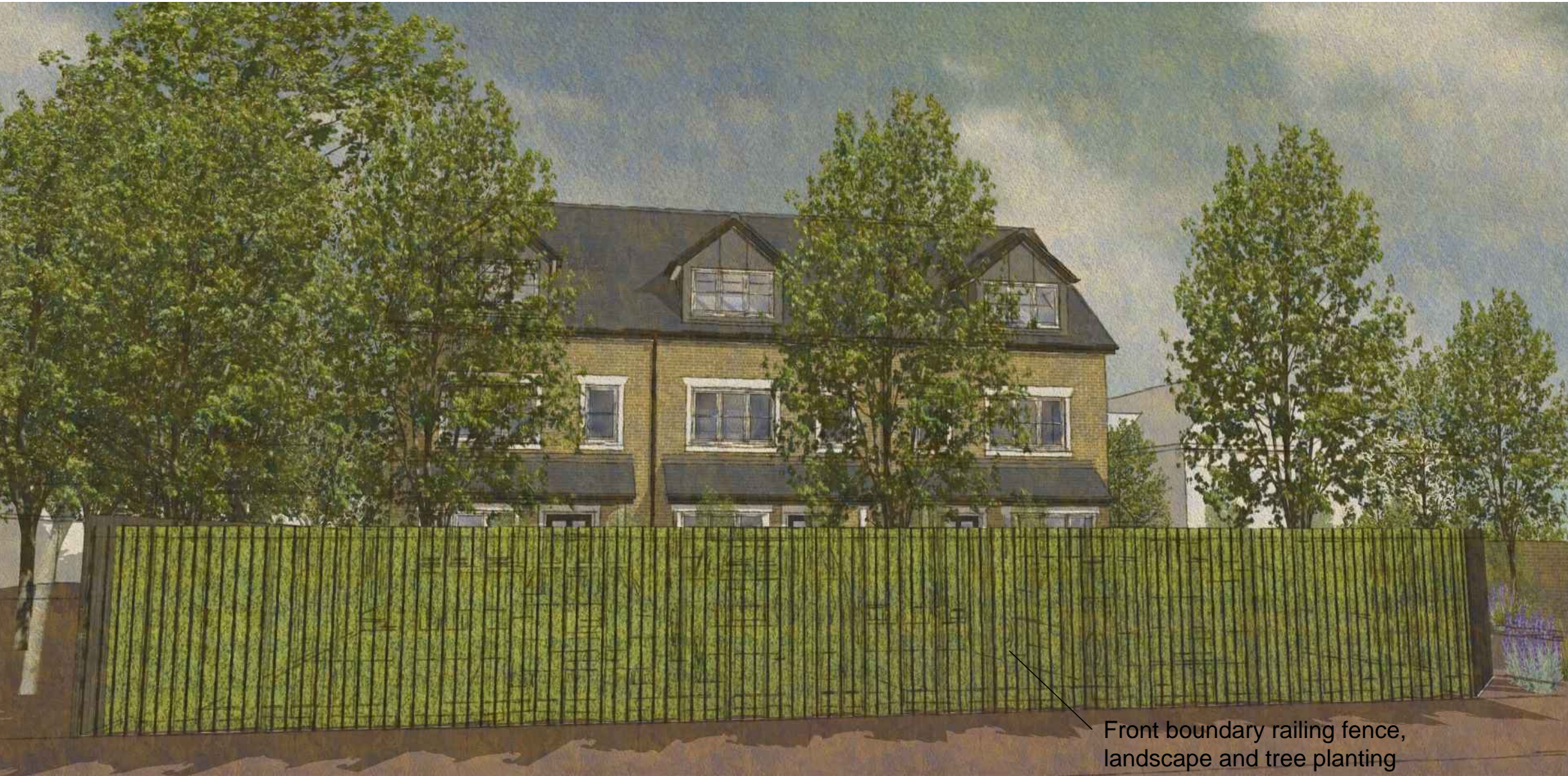
VIEW 5 - STRATFORD ROAD FRONTAGE