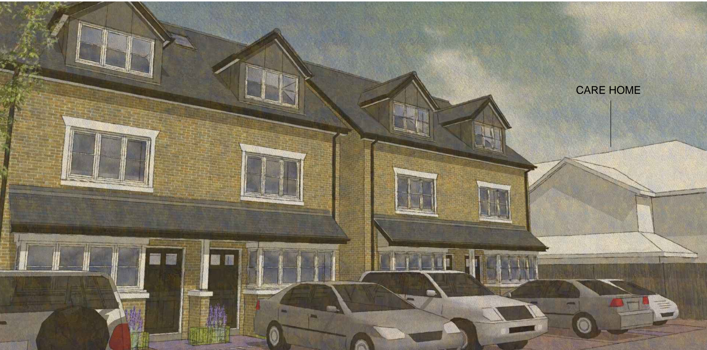
VIEW 7 - FROM COURTYARD, FRONTAGES OF PLOTS 4-7